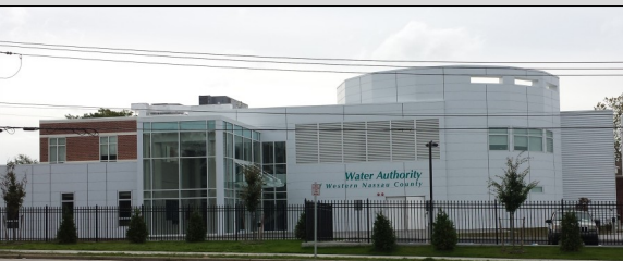
Completed Water Authority Headquarters Building 1580 Union Turnpike, New Hyde Park