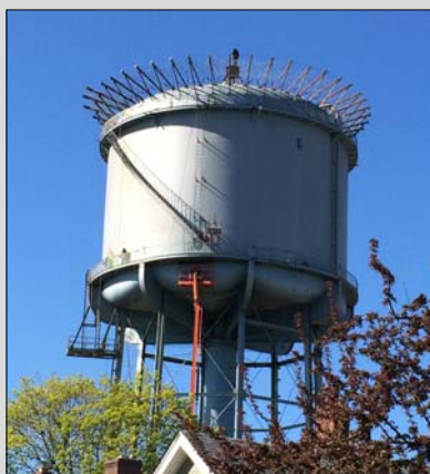
Rehabilitation of Tank No. 19 located in New Hyde Park began in November, 2014. Completion of project expected around August, 2015.