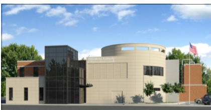
Artist Rendering of new Water Authority Headquarters currently under construction

Watch for an announcement of our upcoming move to 1580 Union Turnpike, New Hyde Park, hopefully the end of this summer.