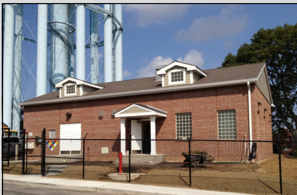
Completed Iron Removal Facility at Well Station No. 28